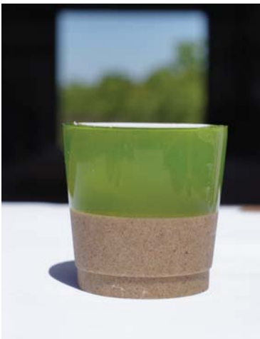
LEFT: Set acrylicamide grout sample. The upper half of the sample is pure acrylicamide with dye. The lower half of the sample is play sand that has been permeated and solidified with the grout.

The third grout cover was constructed utilizing permeation grouting as recommended. After relatively low groundwater inflow had been encountered during mining of the first three grout covers, it was decided that mining would continue