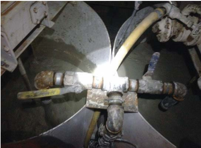
ABOVE: Microfine grout being delivered to agitator / pumping plant for grouting of secondary permeability features at the top of the Mt. Carmel Formation