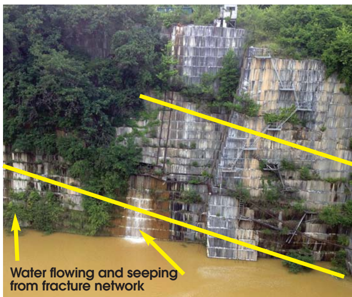
Quarry wall demonstrating secondary permeability. Large fractures are located just above yellow lines in the picture (note vegetation growing in fracture fill).

both types of permeability often require multiple remediation techniques and multiple variations of those techniques. Generally, five mitigation techniques are available for rock masses containing both permeability types: avoidance, dewatering, drainage, grouting, and freezing. Most mitigation programs will incorporate two or more of the mitigation techniques.